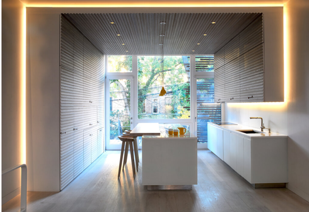
Passive Townhouse Gut Renovation, Park Slope, Brooklyn