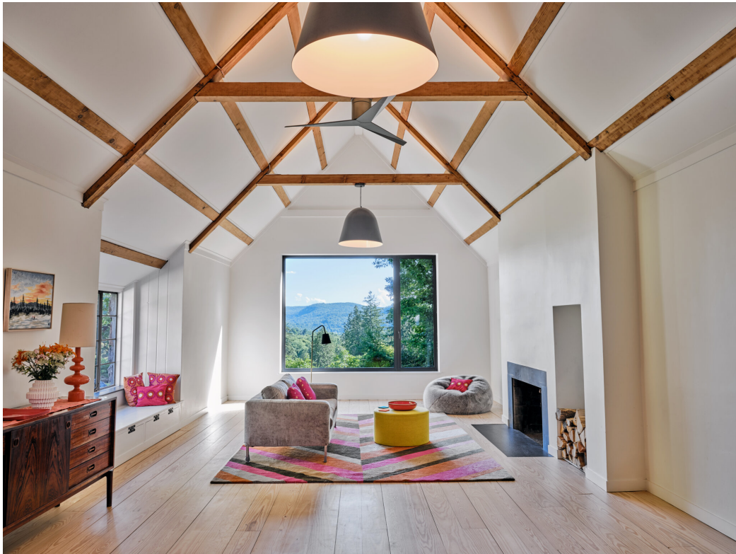
Modern Passive House Addition, Cornwall, Connecticut, Photo by Morten Smidt