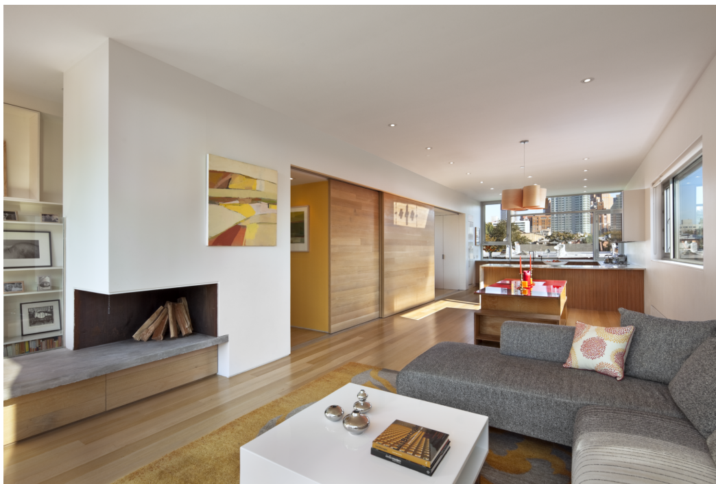
Jefferys' Modern Sustainable Townhouse in Boerum Hill, Brooklyn, Photo by Morten Smidt

Inspired by these travels, orange, yellow, red, and pink have become my favorite color scheme to design with. These colors make me feel happy and create a warm and cheerful space. Just a pop of one of these colors can transform a space from cold minimal to joyous.