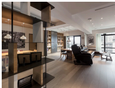
PartiDesign Creates Spacious Open-Concept Apartment Using Extensive Wood Throughout