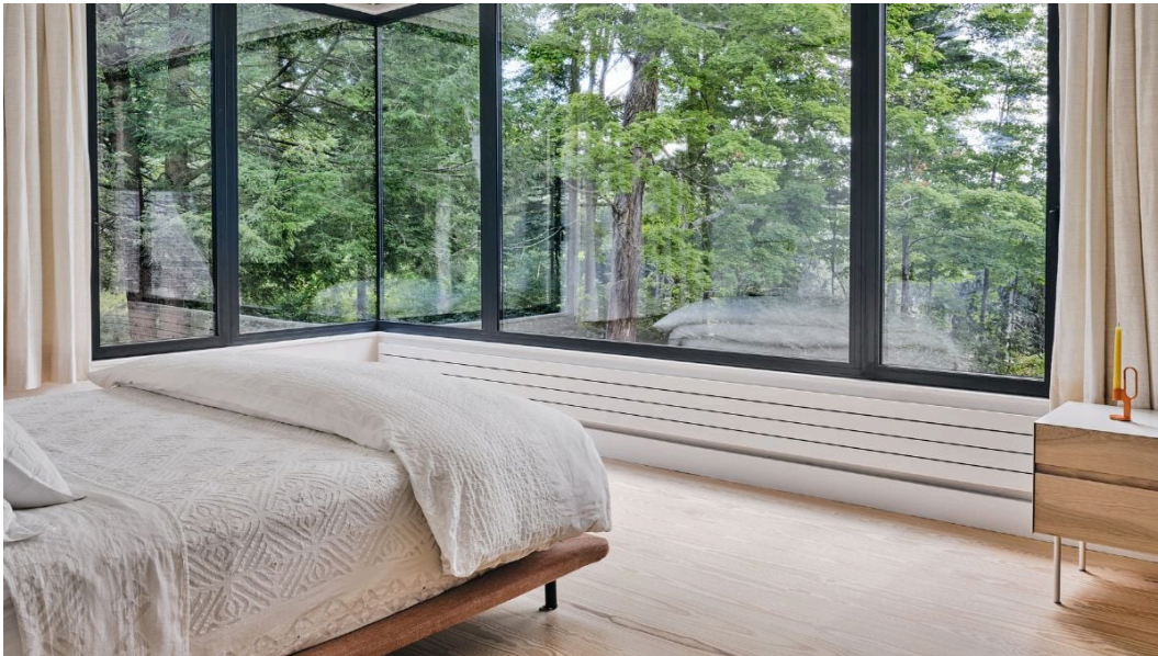
Locally obtained wide-plank panels adorn the bedroom floor, enhancing the natural surroundings seen through the floor-to-ceiling corner window.