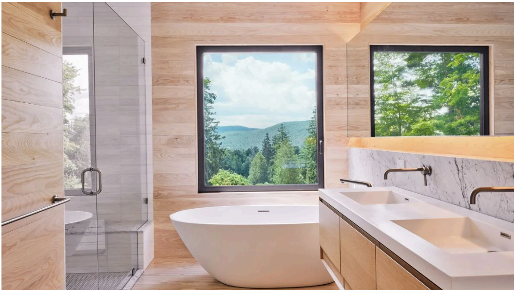
The full bathroom is a minimalist haven with a view of the surrounding environment.