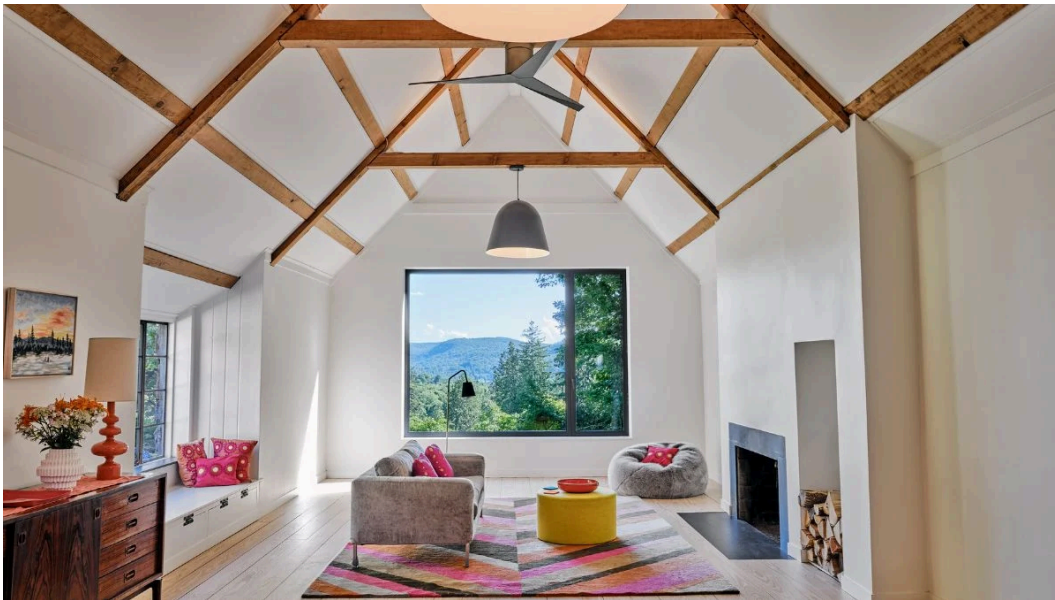
A spacious living and dining room with a vaulted cathedral ceiling and original exposed wood beams serve as a warm gathering space for families to gather in front of the minimalist fireplace, soaking in the views through an immense black-framed window.