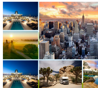
30 Great Alternatives to Renting an Apartment