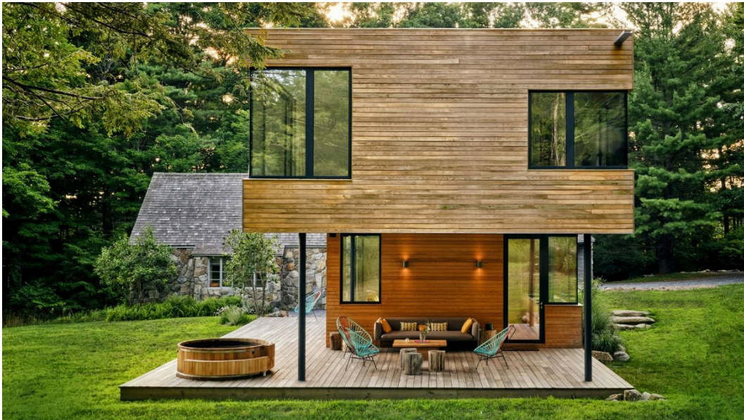
The two huge corner windows, one off each bedroom, that blur the distinctions between indoors and out are the showpiece of the modern addition, which is clad in horizontal cypress siding.