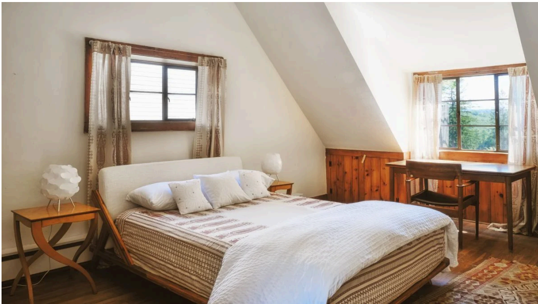
The addition's minimalist, Scandinavian-inspired interior design allows the surrounding nature to dominate visual attraction from every angle.