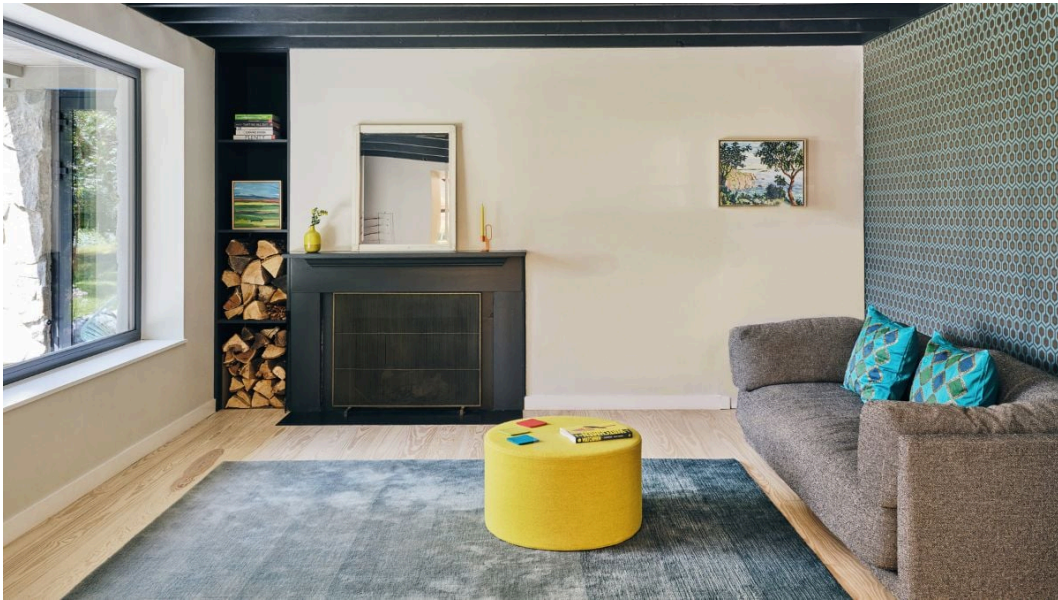
The ancient stone den has a teal and gold David Hicks honeycomb wallpaper, exposed joists, and an old fireplace.