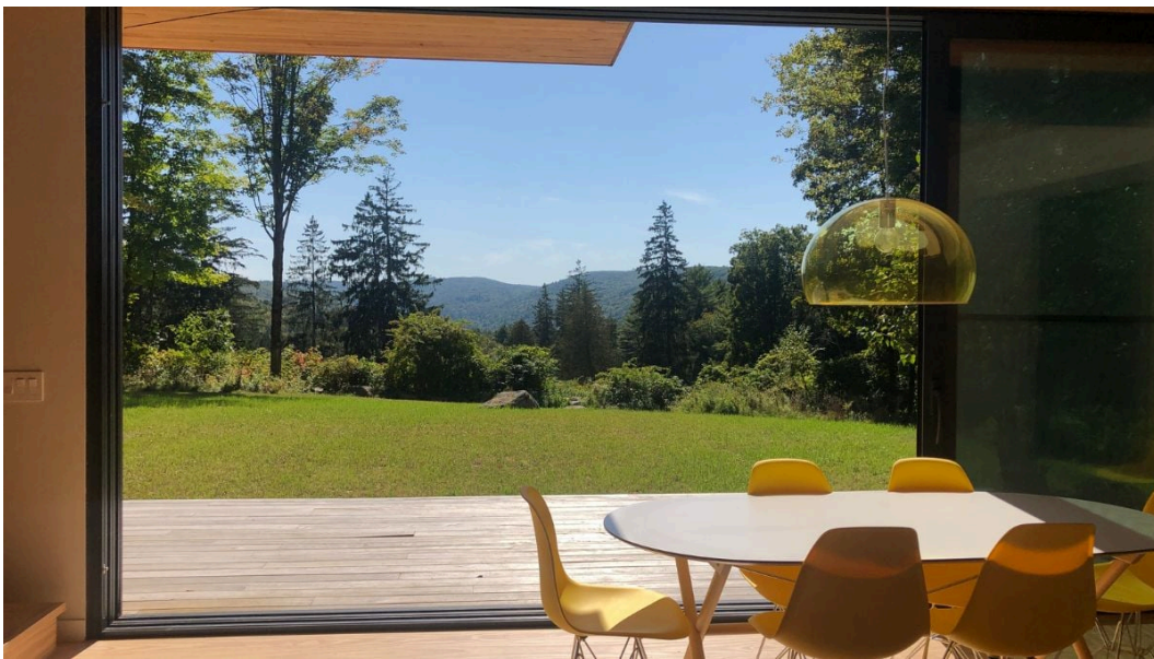
A minimalist countertop design runs parallel to a generous four-seat Carrara waterfall island, while a playful modern dining table and bright yellow Eames chairs sit next to a grand floor-to-ceiling sliding glass door and under an oversized translucent yellow Kartell pendant, creating the illusion of dining with nature.